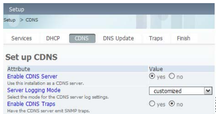
Figure 2-3 Set up CDNS Page (Setup)

Choose the configuration values you want, based on information in the following subsections, then click Next>> to activate your settings. The setup pages that follow are for configuring access controls and traps.