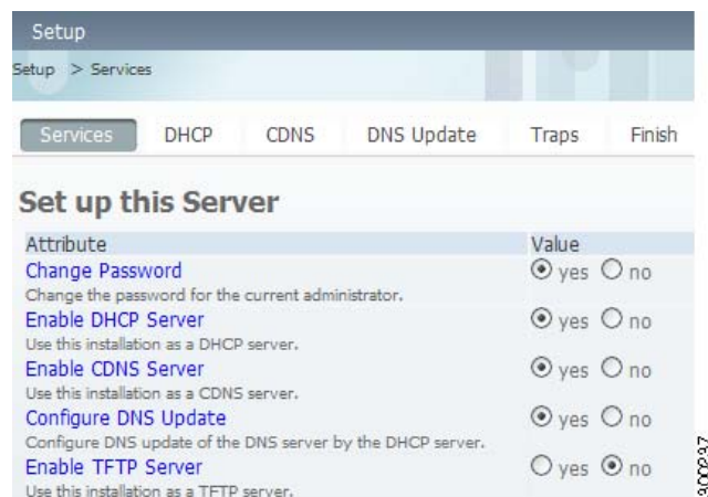
Figure 2-1 Set up this Server Page (Setup)

On this page, decide if you want to enable or disable: