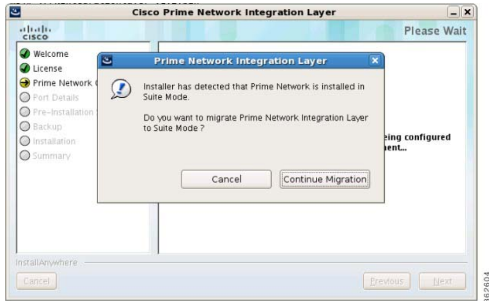
Figure 9-2 Migration to Suite Mode