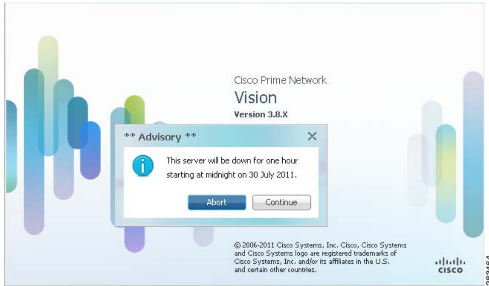
Figure 11-3 Message of the Day Example

The message can be changed as required. However, only one message is applied at a time.