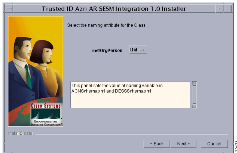
Figure 9-2 Selecting iPlanet Naming Variable

Step 8 Select either Uid or Cn as the inetOrgPerson naming variable, then click Next .