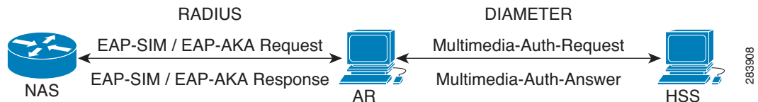
Figure 17-1 Wx Interface Support for SubscriberDB lookup

For more information on Wx interface, see the 3GPP TS 29.124 and TS 29.229 specifications.