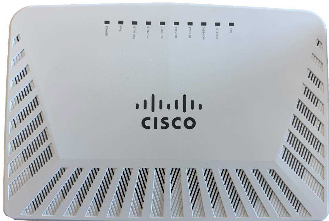
Figure 1: ENC-10G-ONT-14A XGS-PON ONT LEDs with status

The following figure shows the location of the LEDs on the ONT.