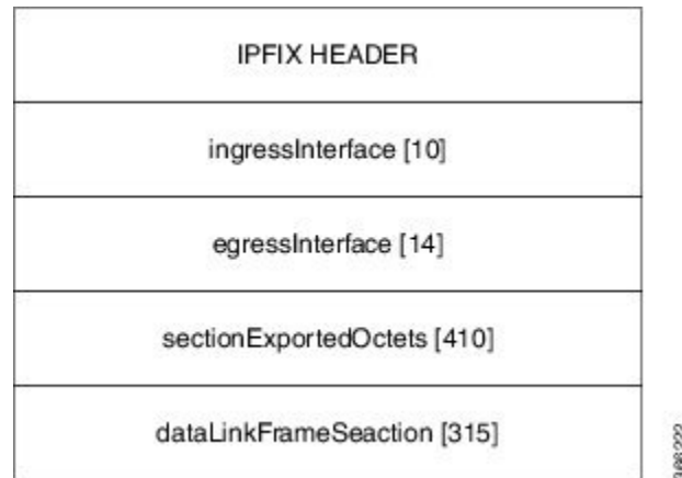
Figure 2: IPFIX 315 Export Packet Format

A special cache type called Immediate Aging is used while exporting the packets. Immediate Aging ensures that the flows are exported as soon as they are added to the cache. Use the command cache immediate in flow monitor map configuration to enable Immediate Aging cache type.