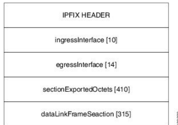
Figure 2: IPFIX 315 Export Packet Format

A special cache type called Immediate Aging is used while exporting the packets. Immediate Aging ensures that the flows are exported as soon as they are added to the cache. Use the command cache immediate in flow monitor map configuration to enable Immediate Aging cache type.