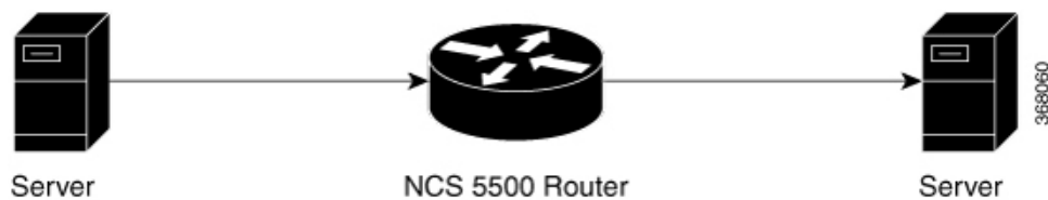
Figure 2: Topology for ERSPAN Egress Rate Limit

The encapsulated packet for ERSPAN is in ARPA/IP format with GRE encapsulation. The system sends the GRE tunneled packet to the destination box identified by an IP address. At the destination box, SPAN-ASIC decodes this packet and sends out the packets through a port. ERSPAN egress rate limit feature is applied on the router egress interface to rate limit the monitored traffic.