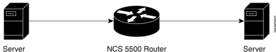
Figure 2: Topology for ERSPAN Egress Rate Limit

The encapsulated packet for ERSPAN is in ARPA/IP format with GRE encapsulation. The system sends the GRE tunneled packet to the destination box identified by an IP address. At the destination box, SPAN-ASIC decodes this packet and sends out the packets through a port. ERSPAN egress rate limit feature is applied on the router egress interface to rate limit the monitored traffic.