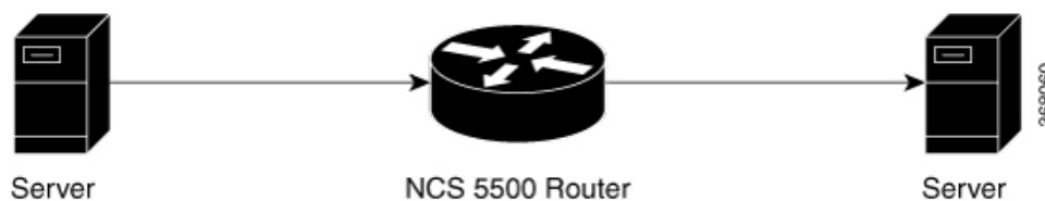
Figure 2: Topology for ERSPAN Egress Rate Limit

The encapsulated packet for ERSPAN is in ARPA/IP format with GRE encapsulation. The system sends the GRE tunneled packet to the destination box identified by an IP address. At the destination box, SPAN-ASIC decodes this packet and sends out the packets through a port. ERSPAN egress rate limit feature is applied on the router egress interface to rate limit the monitored traffic.