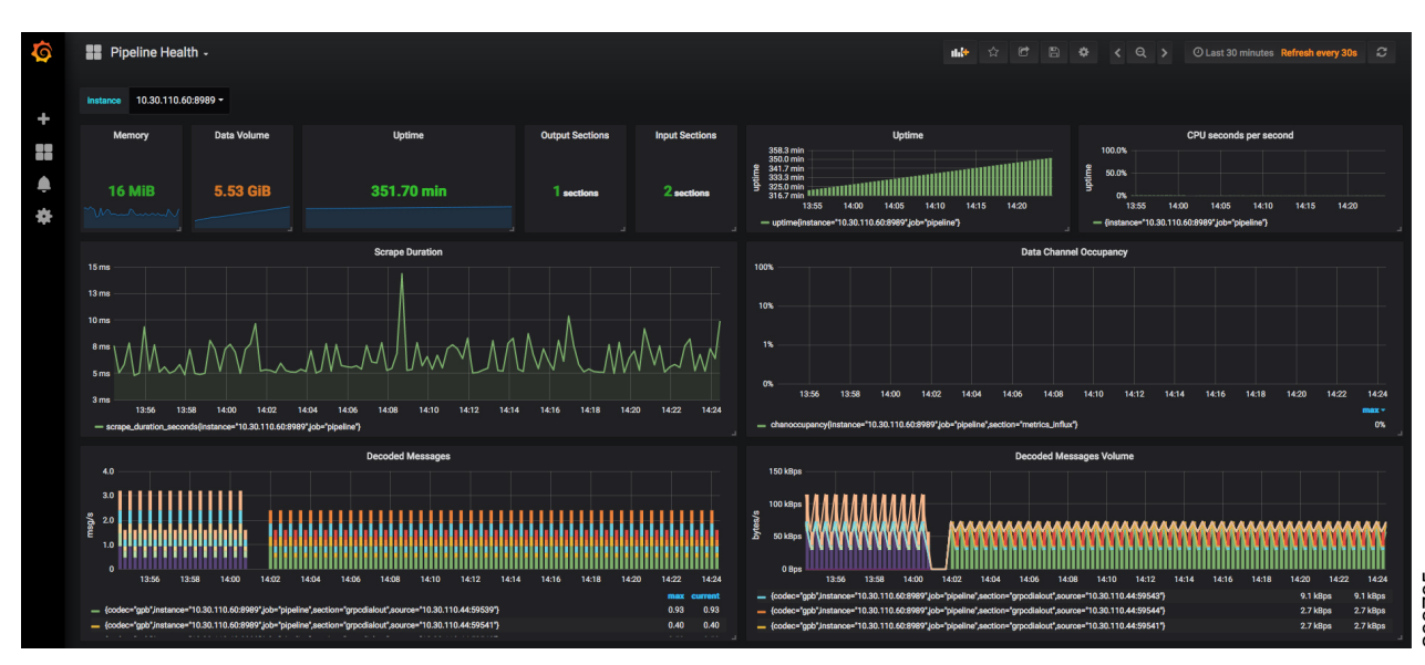
Figure 2: Visual Analysis of Network Health using Telemetry Data

Step 2 Use Grafana to create a dashboard and visualize the streamed data.