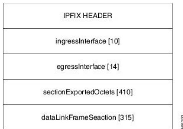
Figure 3: IPFIX 315 Export Packet Format

A special cache type called Immediate Aging is used while exporting the packets. Immediate Aging ensures that the flows are exported as soon as they are added to the cache. Use the command cache immediate in flow monitor map configuration to enable Immediate Aging cache type.