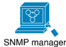
Figure 3: Trap Not Received by the SNMP Manager

In this illustration, the agent sends a trap to the manager, but the trap does not reach the manager. Because the agent has no way of knowing that the trap did not reach its destination, the trap is not sent again. The