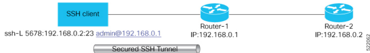
Figure 3: Sample Topology for SSH Port Forwarding

Consider a scenario where port forwarding is enabled on the SSH server running on Router-1, in this topology. An SSH client running on a local host tries to create a secure tunnel to the SSH server, for a local application to eventually reach the remote application server running on Router-2.