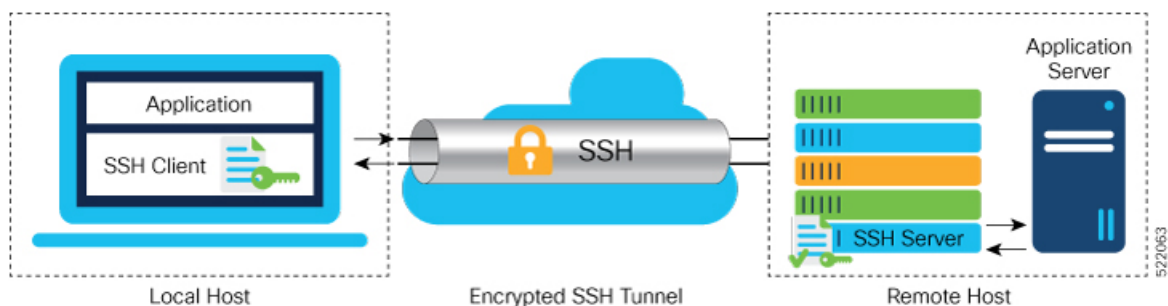
Figure 2: SSH Port Forwarding

Consider an application on the SSH client residing on a local host, trying to connect to an application server residing on a remote host. With tunneling enabled, the application on the SSH client connects to a port on the local host that the SSH client listens to. The SSH client then forwards the data traffic of the application to the SSH server over an encrypted tunnel. The SSH server then connects to the actual application server that is either residing on the same router or on the same data center as the SSH server. The entire communication of the application is thus secured, without having to modify the application or the work flow of the end user.