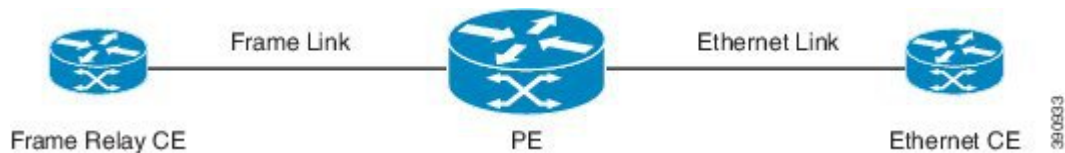
Figure 1: Frame Relay-Ethernet Local Switching Topology

The Frame Relay-Ethernet local switching topology is illustrated in the figure below.