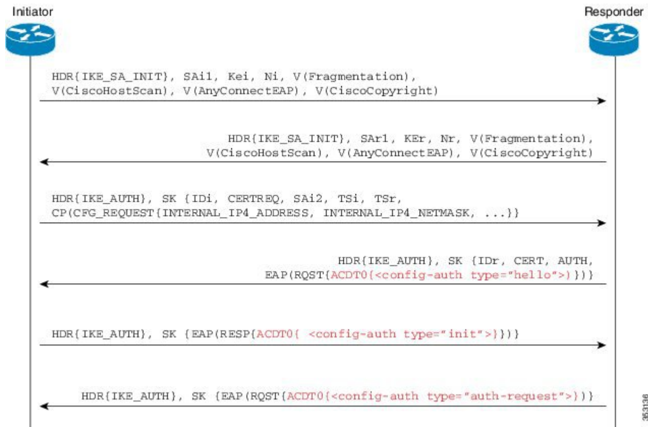
Figure 2: IKE Exchanges using AnyConnect EAP

Authentication in IKE using AnyConnect EAP is a variation of the standards EAP model as described in RFC 3748. When using AnyConnect EAP the public configuration or authentication XML is transported via EAP payloads. The following figure illustrates the typical message flow used by Cisco AnyConnect .