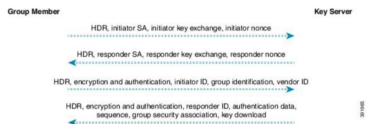
Figure 2: G-IKEv2 Message Exchanges