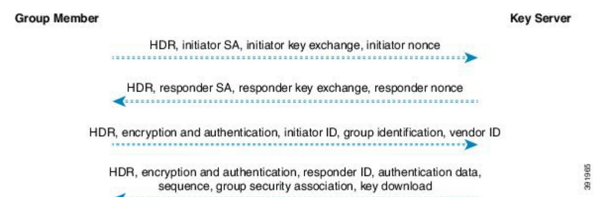
Figure 2: G-IKEv2 Message Exchanges