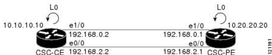
Figure 3: Loopback Interface Configuration for Directly Connected CSC-PE and CSC-CE Devices

The figure below shows the loopback configuration for directly connected CSC-PE and CSC-CE devices. This configuration is used as the example in the tasks that follow.