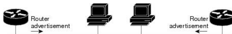
Figure 3 IPv6 Neighbor Discovery: RA Message

Router advertisement packet definitions: ICMPv6 Type = 134 Src = router link-local address Dst = all-nodes multicast address Data = options, prefix, lifetime, autoconfig flag