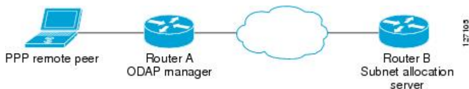
Figure 2: Subnet Allocation Server Topology

When the ODAP manager allocates a subnet, the subnet allocation server creates a subnet binding. This binding is stored in the DHCP database for as long as the ODAP manager requires the address space. The binding is removed and the subnet is returned to the subnet pool only when the ODAP manager releases the subnet as address space utilization decreases.