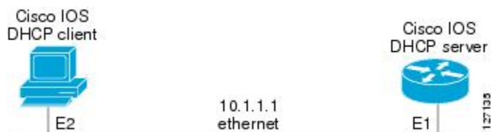
Figure 2: Topology Showing DHCP Client with GigabitEthernet Interface

On the DHCP server, the configuration is as follows: