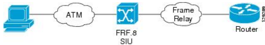
Figure 1: Frame Relay-to-ATM Interworking

You can configure ATM PVCs for IETF-compliant LLC encapsulated PPP over ATM on either point-to-point or multipoint subinterfaces. Multiple PVCs on multipoint subinterfaces significantly increase the maximum number of PPP-over-ATM sessions running on a router.