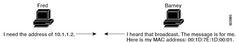
Figure 1: ARP Process

When the destination device lies on a remote network that is beyond another device, the process is the same except that the device that sends the data sends an ARP request for the MAC address of the default gateway. After the address is resolved and the default gateway receives the packet, the default gateway broadcasts the destination IP address over the networks connected to it. The device on the destination device network uses ARP to obtain the MAC address of the destination device and delivers the packet. ARP is enabled by default.