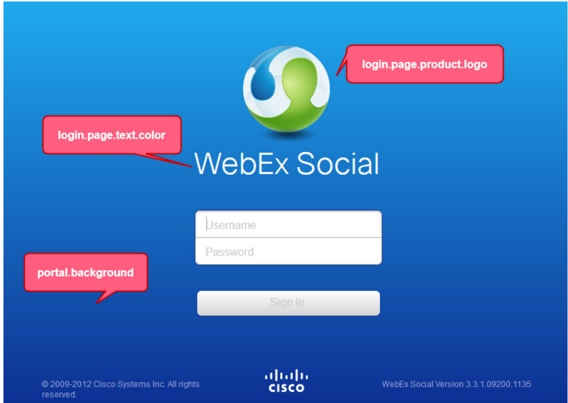
Figure 1 Sign-in Screen Elements

Take a look at the following images to get an idea of what page elements can be themed and what are their names.