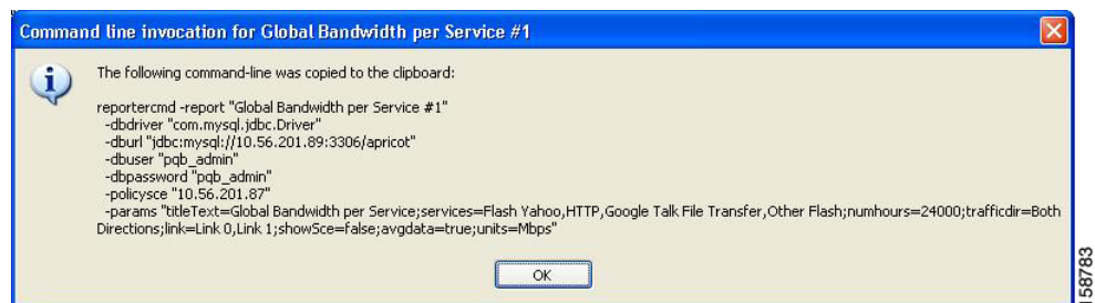
Figure 6-1 Command Line Invocation Dialog

A Command line invocation dialog box appears, see Figure 6-1 , displaying the generated command.