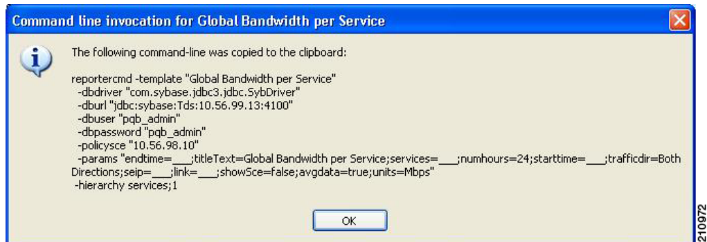
Figure 6-3 Command Line Invocation Dialog

Parameters that have default values are given the default value. A value of ___ (underscore) indicates mandatory parameters that do not have default values.