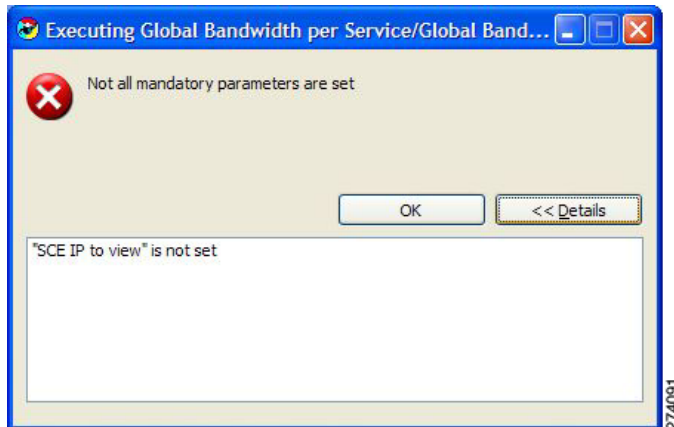
Figure B-3 Error Message Details

To view specifics on an error, click Details (Figure B-3).