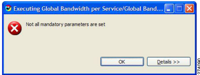
Figure B-2 Error Message

To view specifics on an error, click Details (Figure B-3).