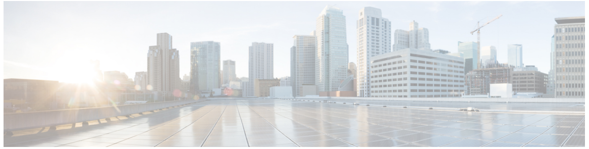
Table-Based Video and VPME Encryption

Table-based video is a configuration mode for video sessions. This feature statically maps UDP flows into appropriate RF QAM channels. Each UDP flow is identified by the destination IP address of the MPEG traffic and UDP port number. The configuration contains the input port number, which is resolved into a unique destination IP address, the UDP port, and an output program number.