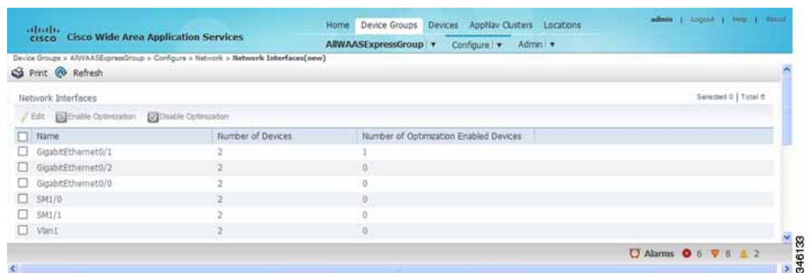
Figure 6-3 WAAS Express Network Interfaces Device Group Interfaces Window

For a device group, the Network Interfaces window is different and displays an interface name, the number of devices that contain that interface, and the number of devices in the group that have optimization enabled on the interface. (See Figure 6-3 .)