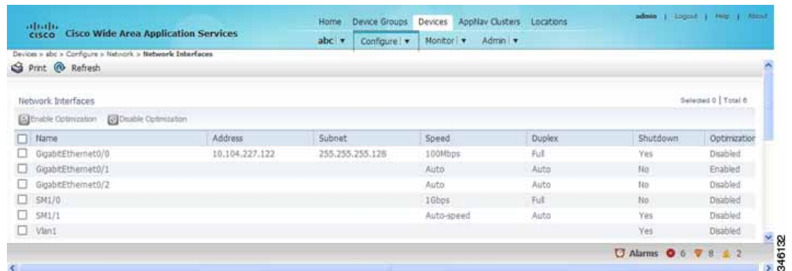
Figure 6-2 WAAS Express Network Interfaces Device Window

For a device group, the Network Interfaces window is different and displays an interface name, the number of devices that contain that interface, and the number of devices in the group that have optimization enabled on the interface. (See Figure 6-3 .)