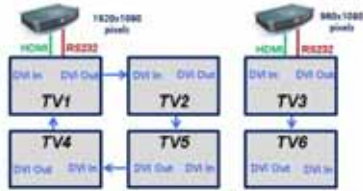
Figure 4 2x3 Video Wall Cabling Example Using TV Tile Matrix Functionality

These dedicated DMPs provide the video signal for the group of TVs that the DMP is connected to through the daisy-chain. Depending on the screen manufacturer, the RS- 232 connections can also be daisy-chained if this feature is available.