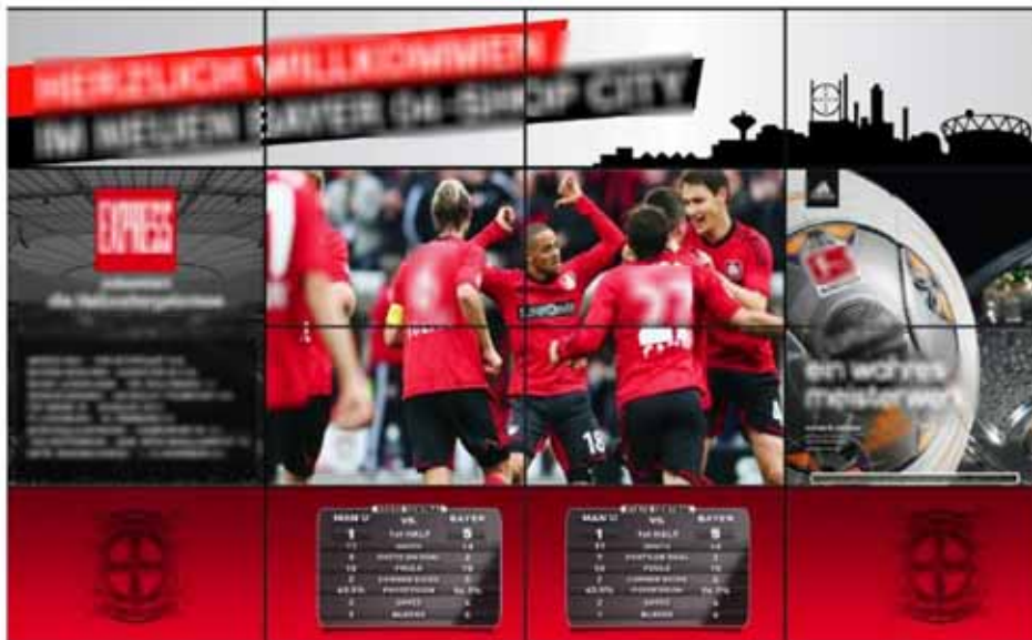
Figure 5 4x4 Video Wall Example

While the 2x3 video wall is the most commonly used video wall configuration, using the information and concepts for the video wall examples, you can create any number of different video wall configurations.