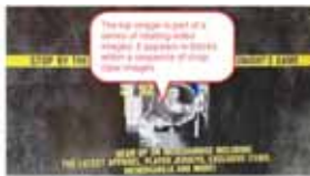
Figure 2 Macroblocking Video Content Example

Using constant bit rate (CBR) video is a requirement. Adhere closely to the content guidelines to reduce the issue. If you are using the Adobe Creative Cloud video encoding tool, you might have to use the special settings to work around a problem with non-standard H.264 support. The rendition settings include using VBR as detailed below.