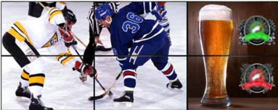
Figure 3 2x3 Video Wall Content Example

A 2x3 video wall is the most common video wall that Cisco recommends because in the left 2x2 group of displays, the game feed maintains the proper 16:9 aspect ratio of the HD game feed.