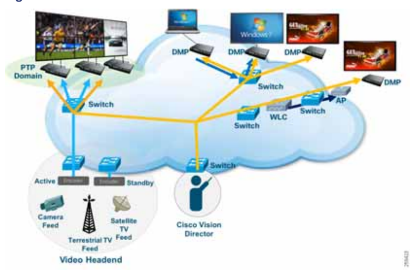
Figure 5 IP Multicast Overview

In third-party networks that do not support multicast (e.g., Cisco Meraki WAN), unicast configurations can be used from the Cisco Vision Dynamic Signage Director to direct DMPs to video sources.