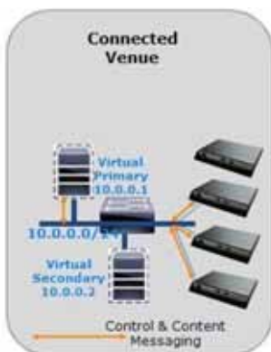
Figure 3 Cisco Vision Dynamic Signage Director Redundancy Under Normal Operation

Figure 4 on page 13 shows the redundancy environment when connectivity from the primary Cisco Vision Dynamic Signage Director server fails. When the primary server fails, a manual process must take place to restore the secondary server from a backup, shut down the primary server, and activate the secondary server.