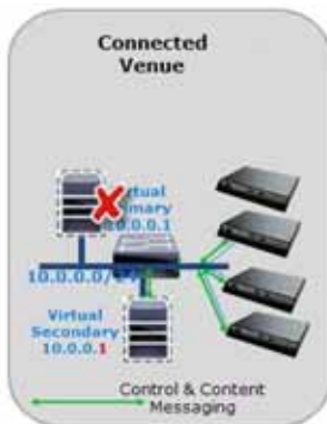
Figure 4 Cisco Vision Dynamic Signage Director Redundancy Under Manual Failover

Notice that the secondary server must be reconfigured to use the same IP address the original primary server. In this example, the secondary server IP address is changed to 10.0.0.1 (from 10.0.0.2) to match the primary server address. When the process is complete, communication and control only occurs between the newly activated secondary server and the rest of the network.