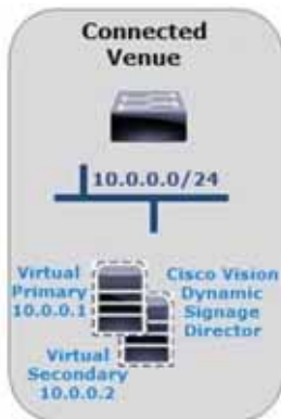
Figure 2 Cisco Vision Dynamic Signage Director Redundancy

Cisco Vision Dynamic Signage Director supports two servers or a dual virtual server environment. Figure 2 on page 12 shows two virtual servers running Cisco Vision Dynamic Signage Director installed on a single subnet.