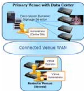
Figure 6 Hierarchical Management in Centralized Cisco Vision Dynamic Signage Director

The Primary Administrator can perform all venue-related functions, including assigning Venue Administrators, Venue Operators, content and scripts into their corresponding venue-specific scopes of control. At the remote venues, the remote Venue Operators can control the scripts associated to their assigned venue scope-of-control.