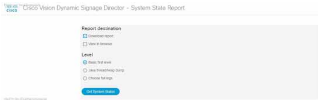
Figure 1 System State Report Screen

Figure 1 on page 111 shows the System State Report screen.