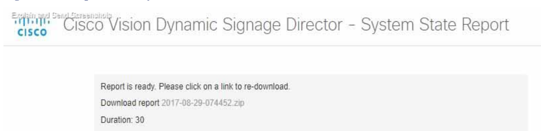
Figure 2 Report is Ready

Depending on the option(s) that you selected before running the report, you can view the report in your browser by selecting the link provided.