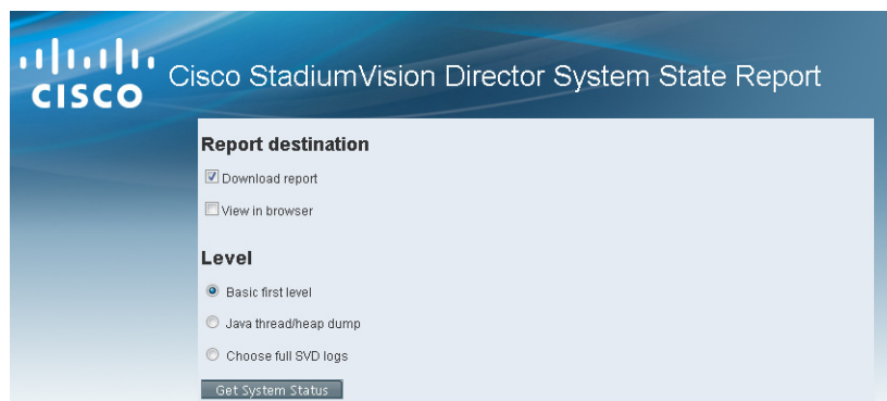
Figure 1 System State Report Screen

Table 1 describes the options provided on the System State Report screen.