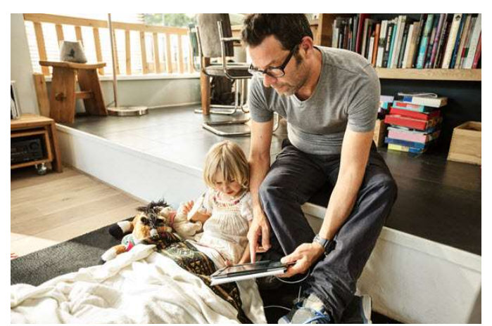
Connecting to colleagues is key in ensuring the team spirit and company culture can thrive

How ensuring human connection and being flexible are key to success