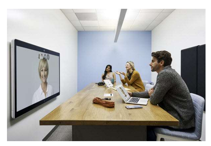
Resilient workspaces will include touchless technologies, enabling safer collaboration

But if offices are going to become spaces for collaboration, how can a company enable this while ensuring safety? The Chartered Institute of Personnel and Development polled UK workers each month over the summer and found around half felt anxious about returning to the workplace. A fifth of those who had returned were not satisfied with the health and safety measures put in place by their employers.