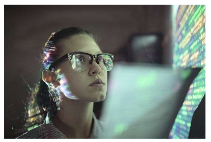
Cisco deploys Al-based systems that can spot unusual behaviour

The hurried shift to remote working has left some businesses vulnerable