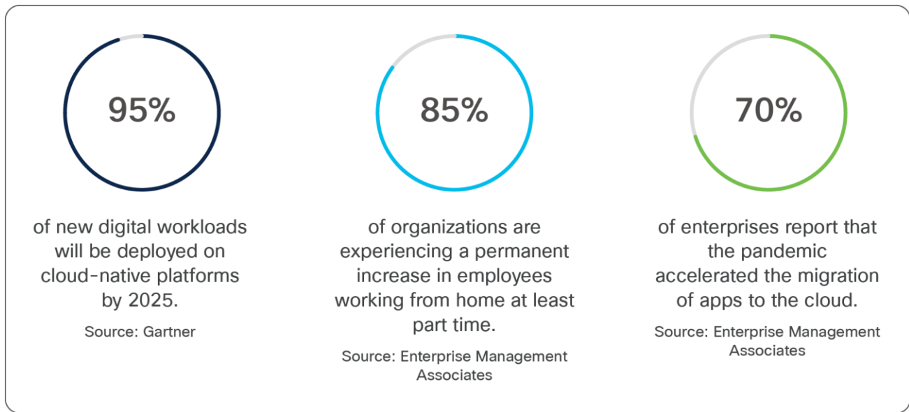
Figure 1. Trends driving migration to the cloud

This is where cloud comes in. IT organizations need the right blend of networking technology, simplicity of management, and operational agility to deliver hybrid work at scale. Networking teams are implementing cloud network management to: