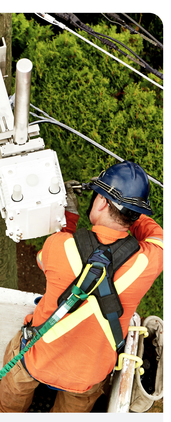
Figure 2. All Cisco Catalyst industrial routers are field upgradable (IR8140 shown)

within the IP suite. Cisco's commitment to interoperability helps utilities simplify systems, lower costs, and improve uptime.