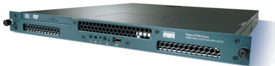
Figure 1. Cisco 2700 Series Wireless Location Appliance

By design, the Cisco Wireless Location Appliance provides native location services in the WLAN infrastructure to lower customers' total cost of ownership and extend the value and security of the existing WLAN infrastructure by making it "location ready." As a component of the Cisco Unified Wireless Network , the Cisco Wireless Location Appliance uses Cisco wireless LAN controllers and Cisco Aironet® lightweight access points to track the physical location of wireless devices to within a few meters. For areas requiring very high fidelity and deterministic location, Cisco Compatible Extensions Wi-Fi tags support chokepoint-based notifications. The centralized WLAN management capabilities and intuitive GUI of the Cisco Wireless Control System (WCS) are extended for managing and configuring the Cisco Wireless Location Appliance, making setup fast and intuitive.