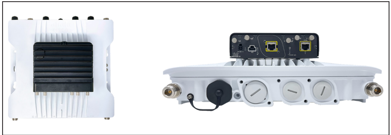
Figure 4. The Catalyst IW9165E vs. the Catalyst IW9167E: Compact DIN rail form factor for easy integration into assets

The following figure compares the Catalyst IW9167E with the Catalyst IW9165E .