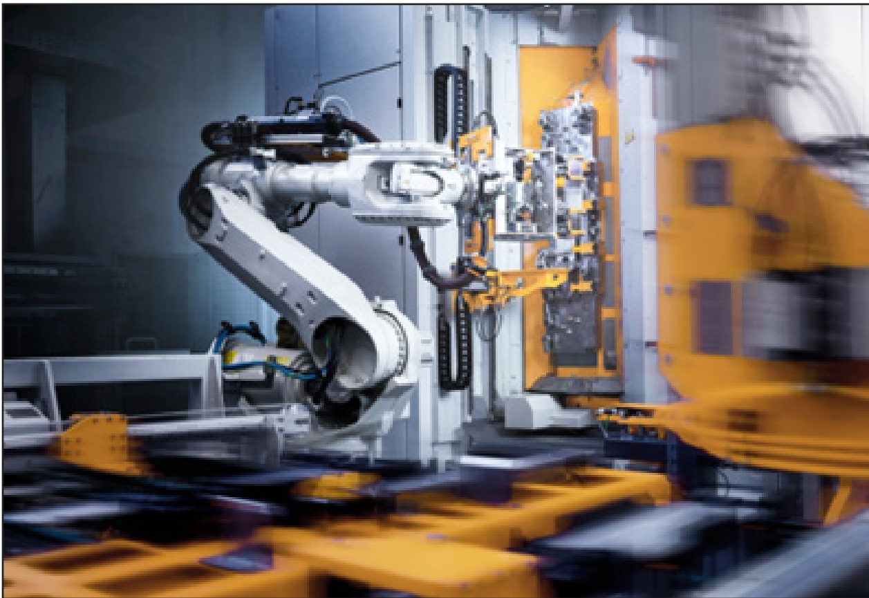
Figure 1. Wireless is a key enabler for automation in factories to connect robots and moving vehicles

What if you could connect your growing number of mobile and stationary assets with wireless that works even in the presence of obstacles and RF interference? We give you technologies that work for your specific deployment scenario, your applications, and your IT and/or OT teams.