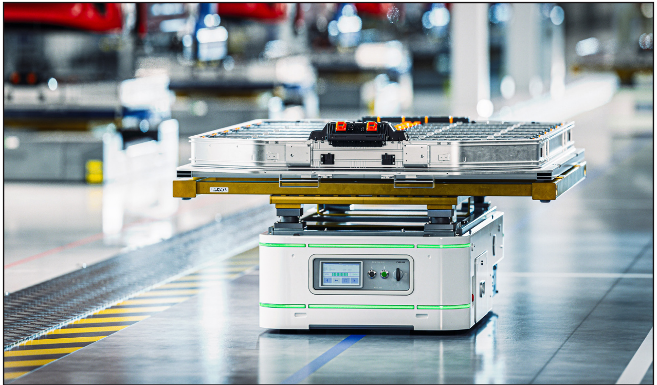
Figure 2. A large car manufacturer needed to deploy many new AGVs fast

Let's consider this example, based on a real organization.