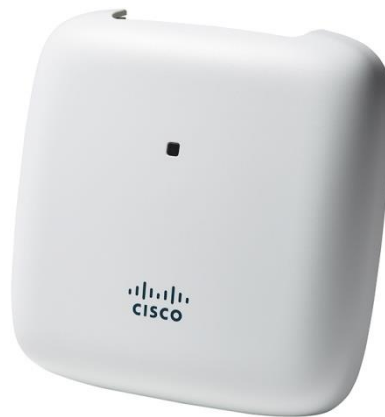
Figure 1. Cisco Aironet 1815m

With the increased coverage area, 802.11ac Wave 2 support, and the functions and features of an enterprise-level access point, the 1815m fully meets the growing requirements of wireless networks by delivering a better user experience (Figure 1).