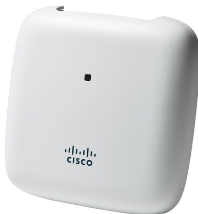
Figure 1. Cisco Aironet 1815m

With the increased coverage area, 802.11ac Wave 2 support, and the functions and features of an enterprise-level access point, the 1815m fully meets the growing requirements of wireless networks by delivering a better user experience (Figure 1).