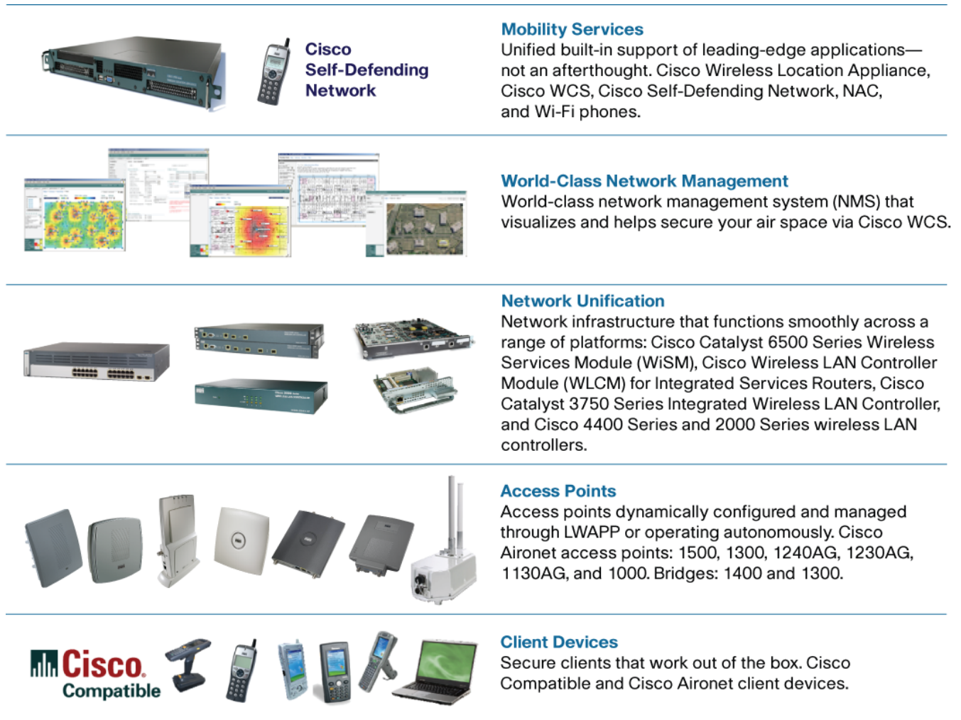
Figure 2. The Cisco Unified Wireless Network Components