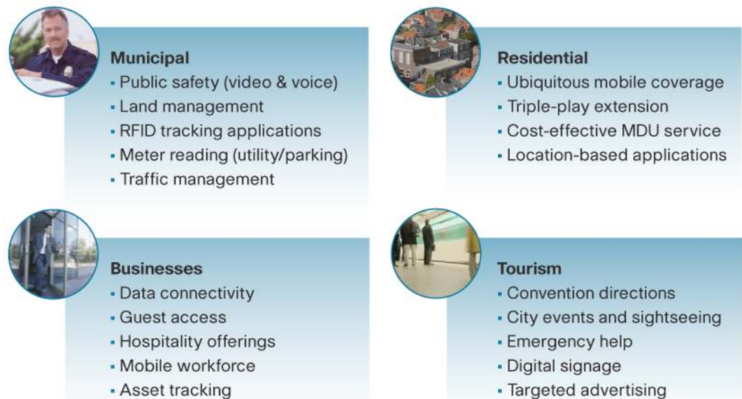
Figure 1. Applications Available with the Cisco Outdoor Wireless Networking Solution

City officials and first responders have traditionally used wireless communications to exchange information with each other, but their outdated communications tools are too slow to support more sophisticated applications. Now many agencies are enhancing and complementing these systems with the Cisco Outdoor Wireless Networking solution based on the IEEE 802.11 standard, making it possible to store and retrieve data at far greater speeds. In doing so, they not only increase the