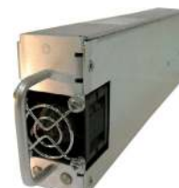
Figure 3. Power Supply