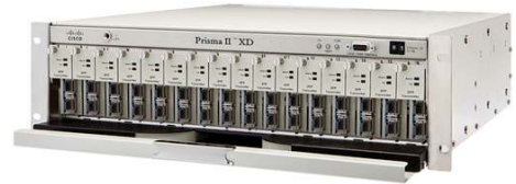
Figure 2. XD Chassis