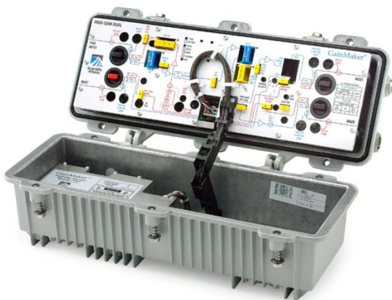
Figure 1. GainMaker HGBT System Amplifier

The GainMaker High Output High Gain Balanced Triple (HGBT) System Amplifier (Figure 1) has three forward outputs and is ideally suited for providing high (bridger)-level RF to the feeder network.