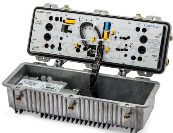
Figure 1. Cisco GainMaker GaN HGBT System Amplifier

Cisco GainMaker 1 GHz system amplifier modules have increased gain to allow drop in for 750-MHz spacing and are mechanically compatible with previous Cisco GainMaker System Amplifier II, II+, and III housing bases, often allowing upgrade to higher bandwidth with no respacing or resplicing. The DC power supply is modular and located in an updated housing lid for easy access. All Cisco GainMaker 1 GHz system amplifier modules are factory configured with reverse amplifier, diplex filters, thermal compensation circuit, forward interstage pads, and equalizer to promote optimal performance. Optional single-pilot automatic gain control (AGC) configurations are also available.