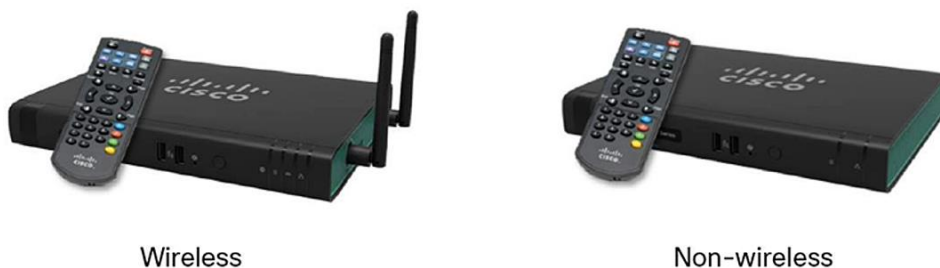
Figure 1. Cisco Edge 340 Digital Media Player

Compared with PC-based alternatives, the Cisco Edge 340 DMP delivers the benefits of a highly reliable, robust platform that excels at power efficiency. These qualities make the Edge 340 the industry leader in the digital media player market. Cisco Edge 340 DMPs have both wireless and non-wireless versions (Figure 1); the wireless version supports Wi-Fi and Bluetooth functions.