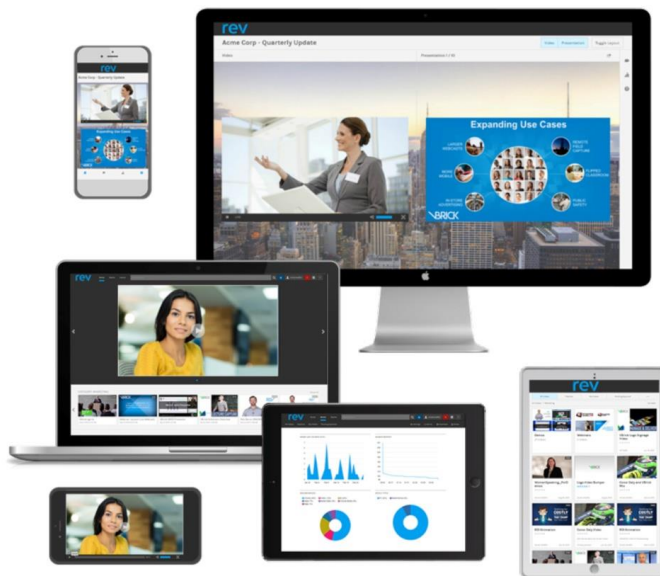
Figure 1. Rev Delivers High-Quality Video on a Range of Mobile and Desktop Devices