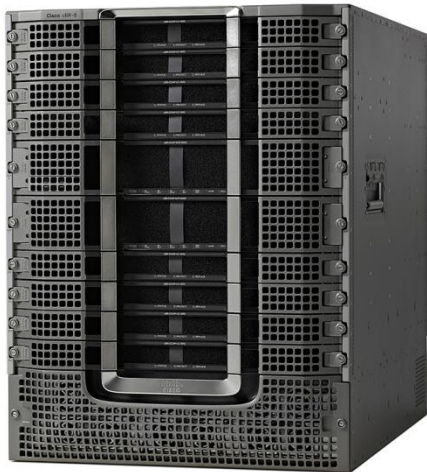
Figure 1. Cisco cBR-8 Converged Broadband Router

With industry-leading density and the capability to converge DOCSIS data, MPEG video, and IP video onto a single system, the Cisco cBR-8 Converged Broadband Router provides cable operators with a simple, cost-effective path to a full CCAP and the all-IP infrastructure. In addition to new DOCSIS® and optical networking capabilities, the Cisco cBR-8 Converged Broadband Router will also be capable of applying software-defined networking (SDN) and virtualization technologies to virtualize, integrate, and automate the access architecture of cable operators.